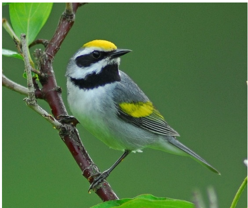
Golden-winged Warbler.