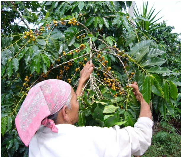
Woman gathering coffee beans in the Sierra Madre de Chiapas. Women participate actively in harvest and coffee selection.

The Sierra Madre de Chiapas is a region of high biodiversity and considered one of the most important areas for birds and wildlife in Mexico. Thus three Biosphere Reserves have been established: La Sepultura, El Triunfo, and El Tacaná. The Mesoamerican Biological Corridor program supports activities to connect them.