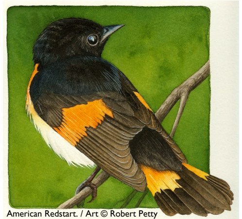
American Redstart.

PIF's celebration of 20 years of bird conservation highlights many important accomplishments, and one of these is certainly the incredible outreach achieved with the launching of International Migratory Bird Day! For more information about IMBD, visit http://www.birdday.org .