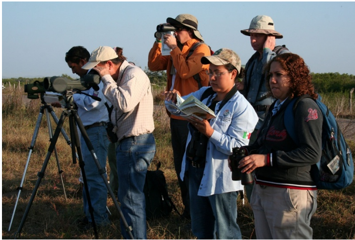
Practicing bird identification and monitoring techniques in the field at the Capacity Building Workshop for Aquatic Bird Monitoring, Mazatlán, Sinaloa, March 2010.

Neotropical migratory and resident bird populations throughout Mexico remain under-studied and poorly known, a fact that is highlighted in the new report, Saving Our Shared Birds: Partners in Flight Tri-National Vision for Landbird Conservation . Such a dearth of information about the status and distribution of birds in Mexico is due in large part to a lack of adequately trained on-site personnel to carry out needed monitoring and inventory work. Although Mexico has a number of federal natural protected areas (NPAs), they often lack staff capable of undertaking the design, implementation, data management, and analysis of bird monitoring efforts.