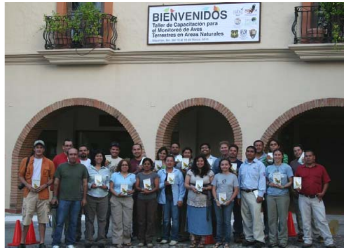
Participants in the Capacity Building Workshop for Landbird Monitoring in Natural Protected Areas in Mexico, held in Mazatlán, Sinaloa in March 2010.

Birders' Exchange, a program of the American Birding Association, assists in the preservation and conservation of these birds and their habitats by collecting used and new birding equipment and redistributing it, free of charge, to researchers, conservationists, and educators working to conserve birds and their habitats throughout Mexico, the Caribbean, Central America, and South America. These donations enable Latin American scientists and educators to gather the data needed to develop local conservation strategies and to educate citizens about bird conservation and ecosystem-wide habitat protection.