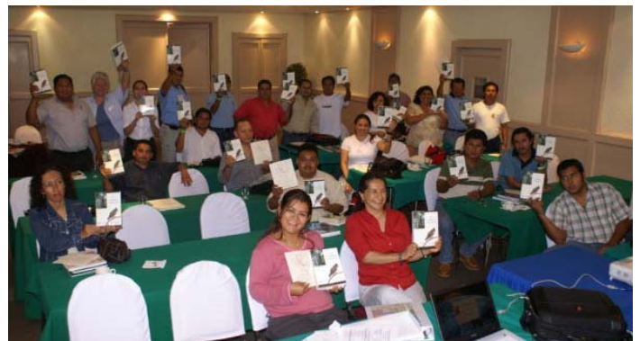
Participants at a wetlands workshop in Tabasco, Mexico with field guides donated by Birders' Exchange.