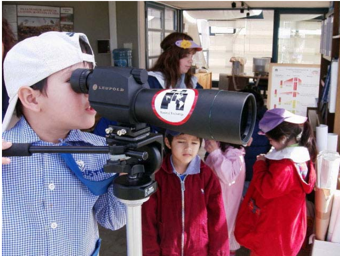
Children in Rio Gallegos, Argentina use telescope donated by Birders' Exchange.

Do you remember the first time you looked at birds through binoculars? How they came alive with color, motion, and markings you'd never noticed before? You could really see the brilliant orange of a Blackburnian Warbler's throat and actually count the streaks on a Yellow Warbler's breast. You could identify these birds by these distinctive details, but would you be able to do so without binoculars or field guides?