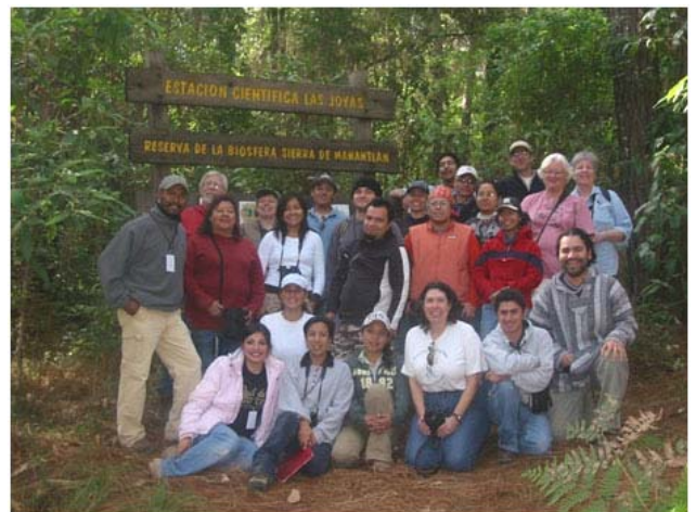
Participants in the second hummingbird conservation workshop sponsored by RMC at Las Joyas Scientific Station in Sierra de Manantlán, one of 37 Biosphere Reserves in Mexico.

By 2008, the Hummingbird Monitoring Network (HMN), a grassroots non-profit organization dedicated to the conservation of hummingbird diversity and abundance throughout the Americas, had begun building tri-national partnerships to address concerns over steep declines in Rufous Hummingbird populations and the lack of adequate information to assess population trends for all but a few hummingbird species. In 2002, HMN began monitoring hummingbird populations in Arizona and California and expanded to British Columbia in 2004, when it became a non-profit organization. In 2007, partnerships with hummingbird biologists from Mexico led to the creation of La Red de Monitoreo de Colibríes (RMC) with founding partners from Universidad de Guadalajara (Jalisco), Universidad Nacional Autónoma de México (Mexico D.F. and Morelia, Michoacán), and HMN. After a workshop in April 2010, El Colegio de la Frontera Sur, San Cristóbal de las Casas, Chiapas joined the RMC.