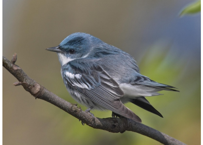
Cerulean Warbler.