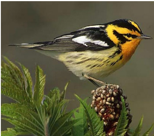
Blackburnian Warbler.