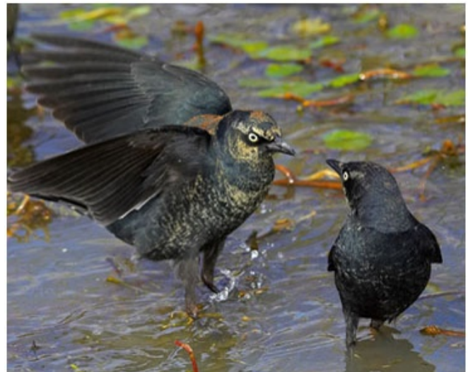
Rusty Blackbird.

A number of causes of the Rusty Blackbird decline have been posited. The conversion of wetlands and bottomland hardwoods to agriculture, particularly in the Mississippi Valley, over the past two centuries has been staggering. It is very reasonable to assume that this large scale loss of habitat has contributed to the long-term decline of Rusty Blackbirds. However, it is unclear whether winter habitat