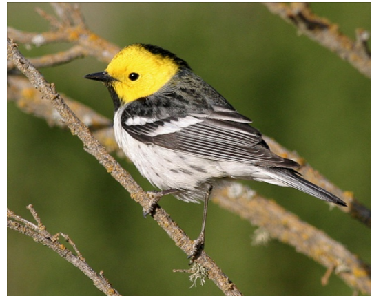
Hermit Warbler.

To work for the conservation of land that supports diversity, people need to link together as well, sharing not only different regional perspectives, but also different skills needed for success.