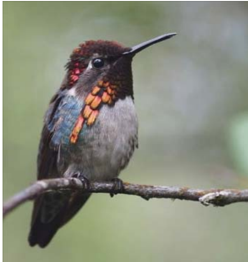
Cuba's Bee Hummingbird.

In April 2009, scientists, land managers, and conservationists from Mexico, the United States, and Canada came together for a multi-day workshop in Tucson, Arizona, funded by the U.S. Forest Service (USFS) International Programs and HMN, to discuss the conservation needs of North American hummingbirds. This first major meeting of the WHP included 82 representatives from 34 diverse institutions that included government agencies, non-profit conservation organizations, universities, and individuals. A primary goal of the WHP is to work in conjunction with other conservation efforts so resources can be effectively used to address hummingbird conservation issues. WHP founding partners include the USFS Pacific Southwest Region, the Hummingbird Monitoring Network, and the USFS International Programs and their Wings Across the Americas (WATA) program.