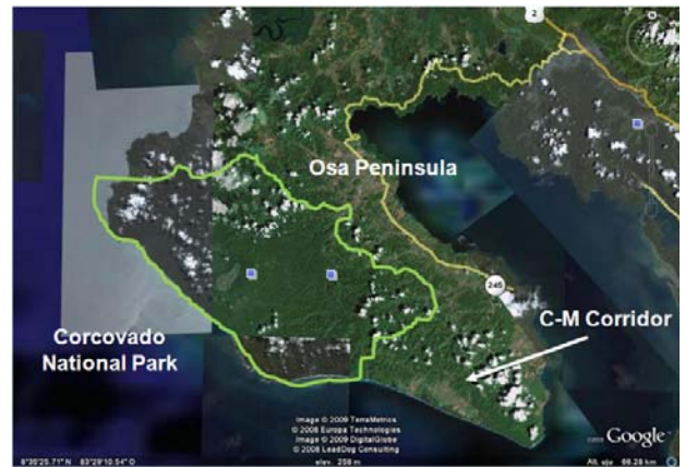
The Corcovado-Matapalo (C-M) Biological Corridor, Costa Rica will result in the protection of tens of thousands of acres of wintering habitat for Neotropical migratory birds.

Wintering habitat protection efforts are gaining steam nationally. It is no mere coincidence that Southern Wings is fledging at the same time Partners in Flight (PIF) celebrates twenty years of bird conservation. Indeed, SW has evolved from PIF's tireless efforts to expand the geography of bird conservation across the Western Hemisphere. By tapping the synergy of collaboration, both Southern Wings and PIF's Tri-National Vision for Landbird Conservation herald a new era of international cooperation on behalf of shared birds.