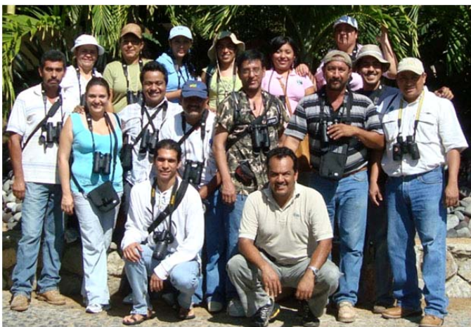
Training workshop for future instructors in Tamarindo, Jalisco, Mexico.

In 2001, I was fortunate to attend the Society of Caribbean Ornithology (now Society for the Conservation and Study of Caribbean Birds) meeting in Cuba. My mission was to see what was needed for partnerships between the Caribbean and the Southeast Partners in Flight (SEPIF) Working Group, specifically in Florida and Cuba. What was needed was beyond my scope to deliver as a state employee: the distribution of quality binoculars and scopes to ornithologists, field technicians, and educational facilities throughout the Caribbean and Latin America. So I started the non-profit, Optics for the Tropics (OFTT), to get the job done.