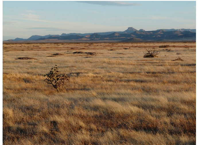
Chihuahuan grasslands are critical to the survival of North America's shared grassland birds, supporting the majority of populations in winter.

Together with its partners from the Universidad Autónoma de Nuevo Leon, The Nature Conservancy-Chihuahua, the Universidad Juarez del Durango, Profaua-Coahuila, Biodiversidad y Desarrollo Armónico (BIDA), Sul Ross State University, and others, RMBO is implementing over 700 1-km line-transect surveys