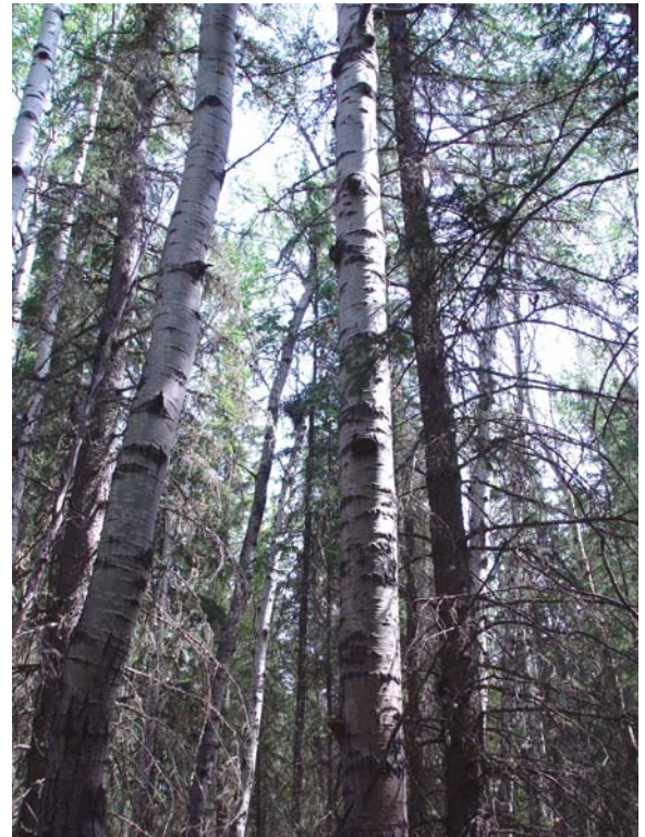
Old-growth aspen-white spruce forests in western Canada host some of the highest landbird diversity in boreal forests.

The success of the BAM project and our ability to provide powerful tools for resource managers stems from the generous contributions of our data partners. We welcome the participation of any biologists wishing to contribute boreal data and extend the legacy of their individual projects, while expanding our sampling coverage and improving the applicability of our results.