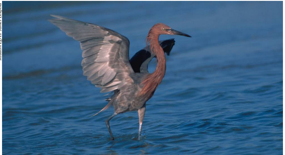
Reddish Egret, James Leopold

The Laguna Madre and Delta of the Río Bravo Natural Protected Area is located in coastal Tamaulipas, due south of the border with Texas. The Laguna Madre of Tamaulipas and Texas is 50,800 hectares in size — the most extensive hypersaline ecosystem of the five that exist on earth. It consists of a system of lagoons with water depths that vary between thirty centimeters and one meter. Laguna Madre marks the northern limit of distribution of various types of tropical vegetation, most notably four species of mangroves that have special protection status in Mexico. Mangroves provide habitat for many crustaceans and fish of economic importance, as well as a diversity of nesting and wintering birds. Mangroves also contribute to the organic richness of the coastal lagoons, helping to maintain high levels of primary productivity.